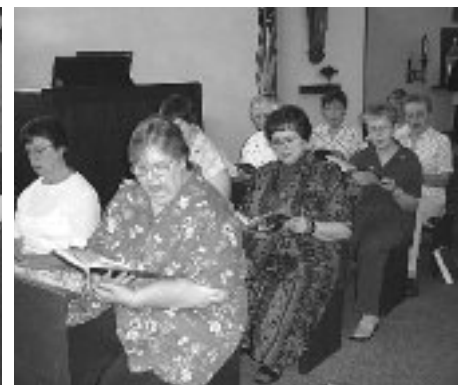
The Sisters' Chorus enhances the music during the celebration of a Sunday liturgy.