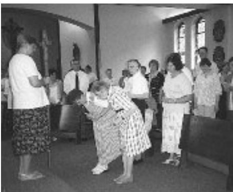
Sisters process into the Monastic Chapel for the beginning of Solemn Vespers.