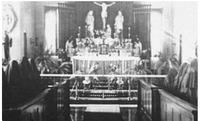
The first chapel of the Benedictine Sisters of Pittsburgh in Pittsburgh, PA

The Vespers Hour still is a time of respite and serenity after a busy day. This Prayer Hour invites the