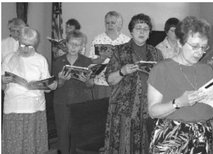
The Sisters’ Choir sings the responsorial psalm during the Eucharistic Liturgy.

long, enduring dream to build a new, more appropriate space for worship and prayer. Over the years, as the liturgical and physical needs of the community have changed, our sacred space has also changed. Necessary renovations were made in order to enhance, facilitate, and sustain our liturgical prayer, the heart beat of our life together. Now we are faced with major problems regarding our current chapel. The floor and windows are desperately in need of repair and many aspects of the present chapel deny easy access, uninhibited use, and full inclusion in community prayer to some of our Sisters. Sisters and guests who are in wheel chairs are not able to enter the main body of the chapel because of a very steep ramp at the entrance. They are relegated to a raised platform which is at a distance from the people gathered in the chapel. The heavy doors are almost impossible for a frail person to open. Because the altar and ambo are raised above floor level, some are prevented from serving as lectors or Eucharistic ministers. The antiquated sound, heating and cooling systems do not function adequately. Since the chapel is so important to the fullness of life within the monastic community, it is incumbent on us to create a more hospitable place where all are welcome, a