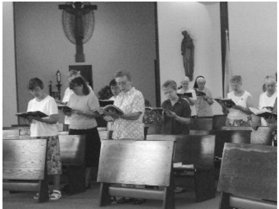
Sisters begin praying Divine Office in the soon to be renovated Marian Chapel.

sacred space easily accessible to all, a place that promotes full participation for everyone. Though at this time in our history, building a new chapel is not feasible, these crucial issues must be addressed.